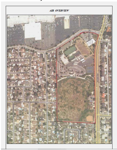
ISSUED BY THE