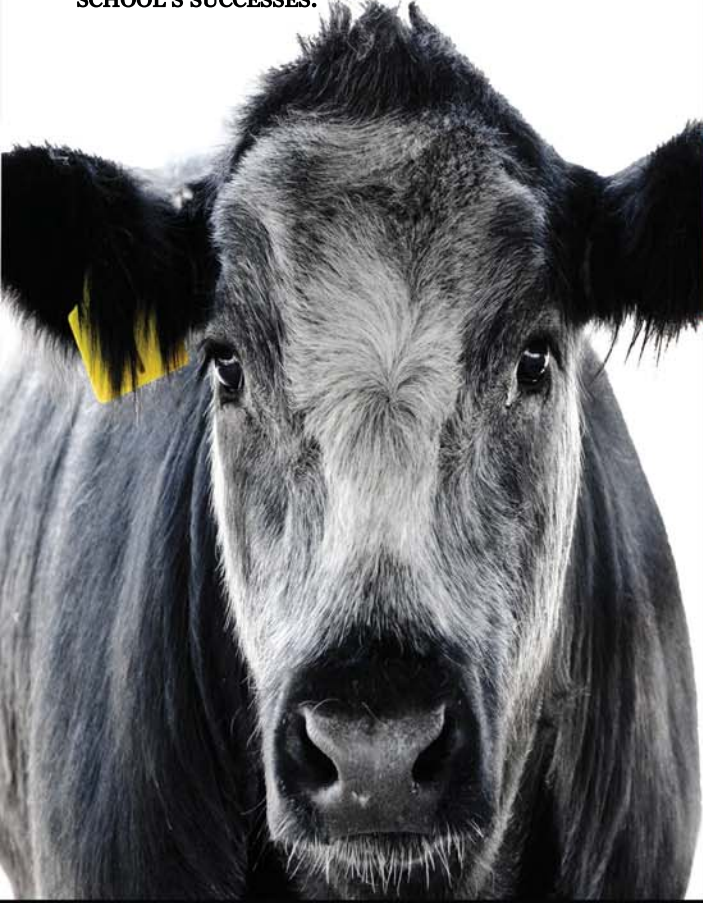
Orange High School's award-winning Agricultural program is one of the few remaining in Orange County.

OUR SCHOOL REFLECTS A CULTURE OF STUDENTS WITH CHARACTER, A CLIMATE OF SAFETY AND TOLERANCE, AND AN ORGANIZATION THAT VALUES EACH MEMBER AS A CONTRIBUTING FACTOR TO OUR SCHOOL'S SUCCESSES.