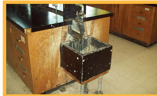
Science labs are outdated