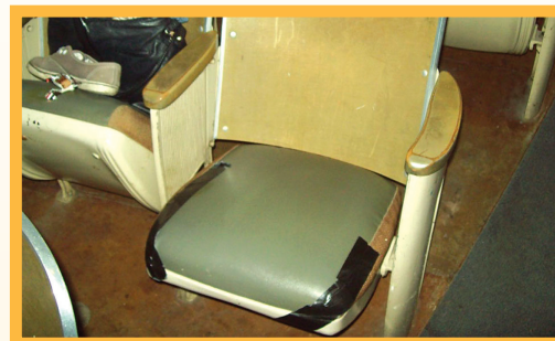
60-year-old facilities need basic safety improvements