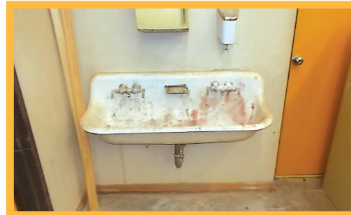
Plumbing and bathroom fixtures need to be replaced