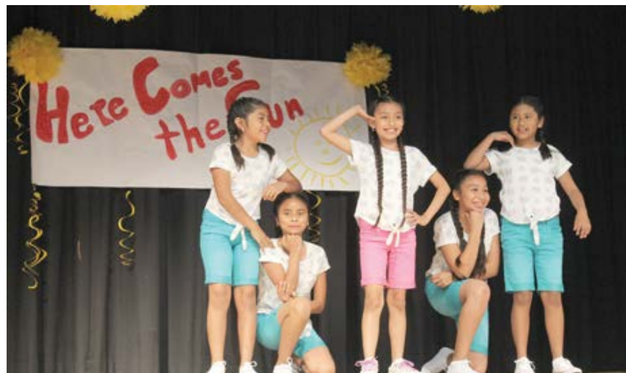
Taft Talent Show

As you can see, Taft students know how to work hard in school, and we have fun!