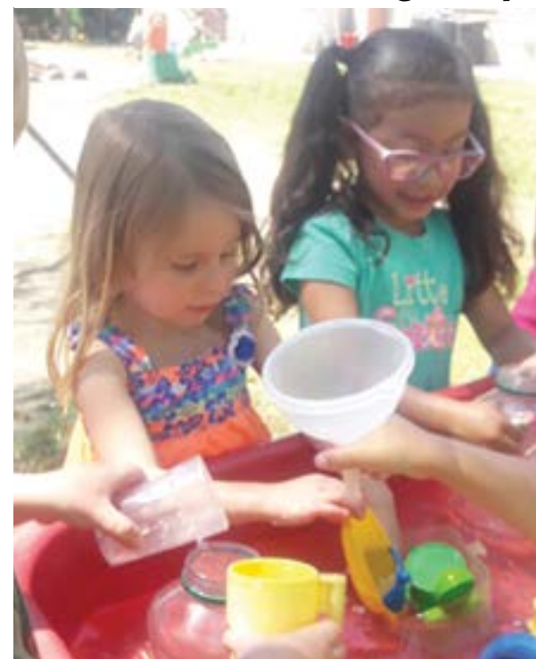
Please see OUSD State Preschool page 3.